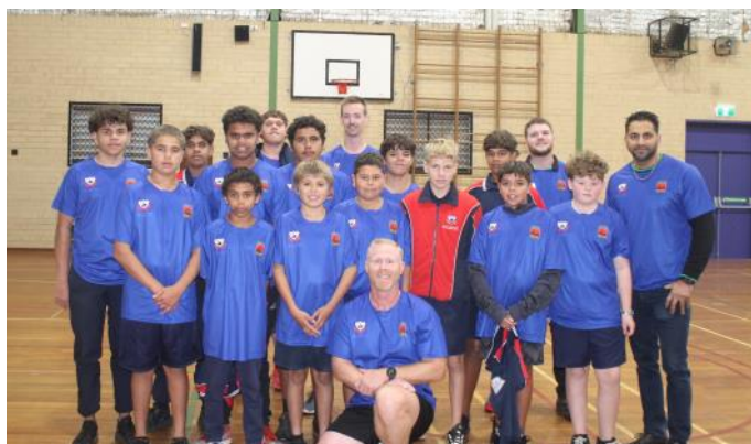
Morning training with Woolworths staff and police