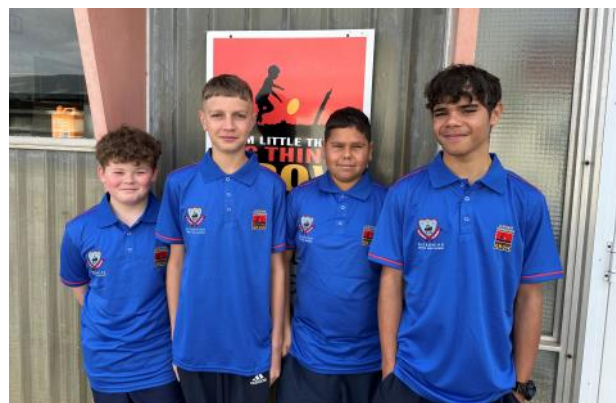
Boys in their new shirts